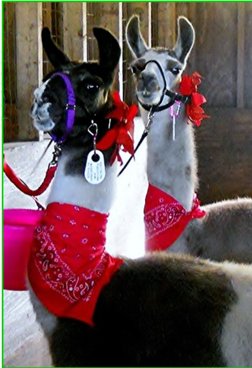
Tweekie and Butterscotch dressed up for their Holiday picture! They belong to member, Maxie Mertes.