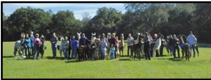
Annual Meeting, Picnic and Alpaca / Llama hike! November 5, 2023

Go to www.falainc.com to join our community!