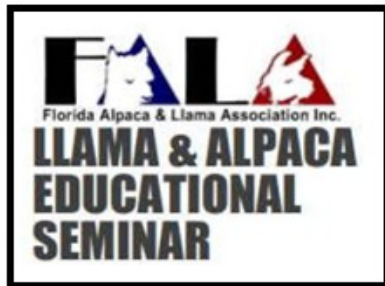
Free Educational Seminar July 22, 2023