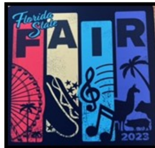
Florida State Fair Sponsors and Participation! February 15-18, 2024