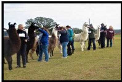
Annual Florida Winter Classic Fun Show! January 27, 2024

FALA Membership is only $25 for the entire year! Become part of our Caring and Sharing Camelid Community . Here are just some of our yearly events our members enjoy.